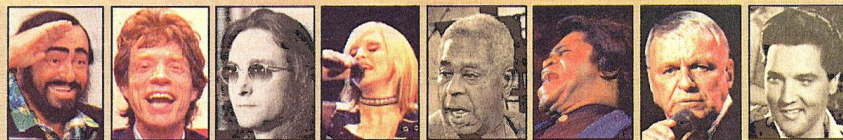
Pavarotti Jagger Lennon Madonna Gillespie Brown Sinatra Elvis